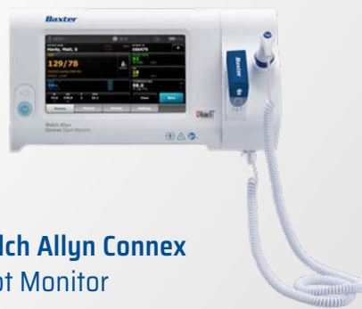
Welch Allyn Connex Spot Monitor