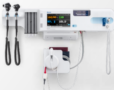
Welch Allyn Connex Integrated Wall System

Inadequate medical device software management can delay a facility's response to safety alerts, or allow cybersecurity vulnerabilities to be exploited and impact patient safety. 1