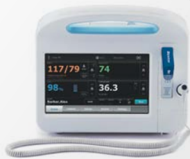
Welch Allyn Connex Vital Signs Monitor