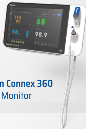
Welch Allyn Connex 360 Vital Signs Monitor